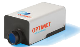
OPTIMET LASER INSTALL window

IK 5000 software integrates laser measuring capabilities to bring you an easy way to acquire large number of data points in a fast and accurate way. With Optimet Laser, you can leverage the Power of QUADRA-CHEK to probe curvy surfaces efficiently.